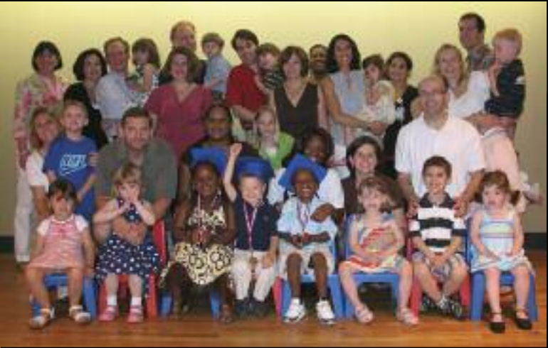
The Child Care Center Class of '09 had a traditional graduation ceremony in the Main Dining Room cheered on by family and friends.