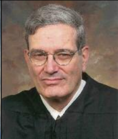
The Honorable José Cabranes